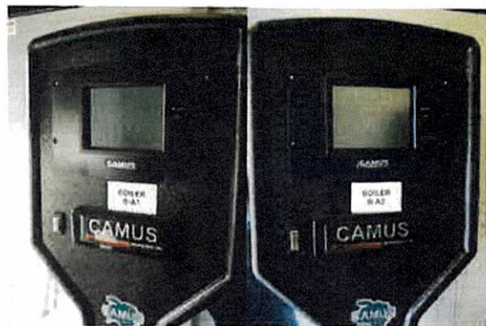
Camus Boilers DFNH-3500 Models