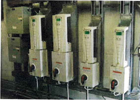
ABB VFD Bank