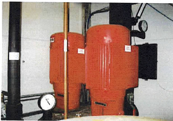
CHWP A1 and A2