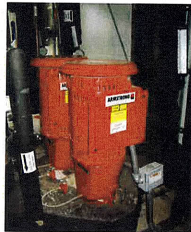
SHHWP A1 and A2