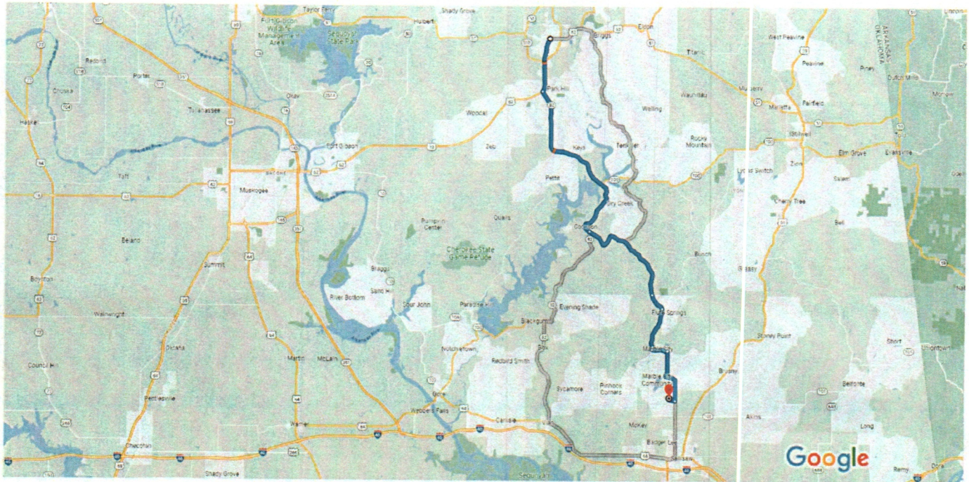
Map data ©2023 Google 2 mi