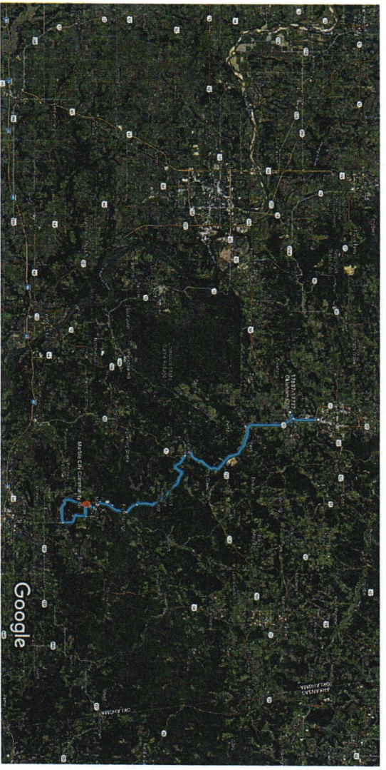
2 mi