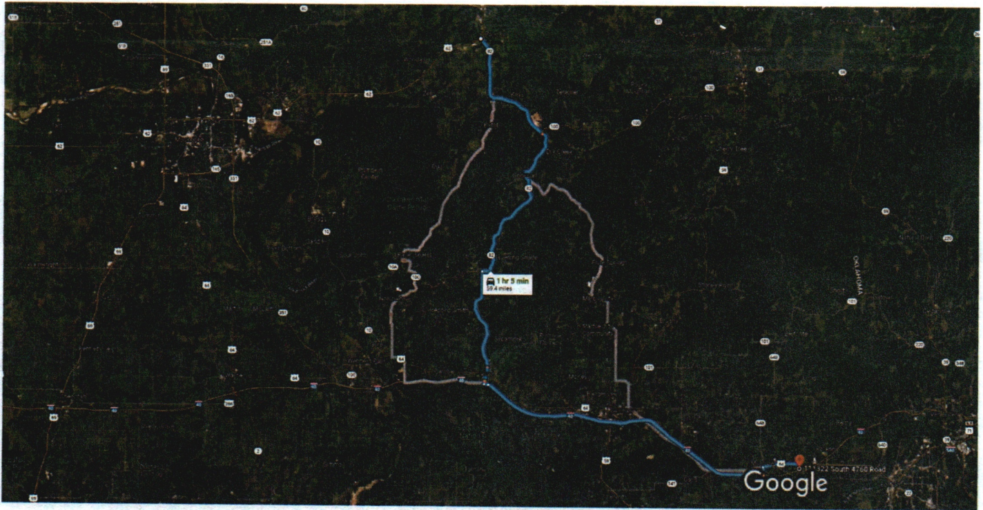
2 mi