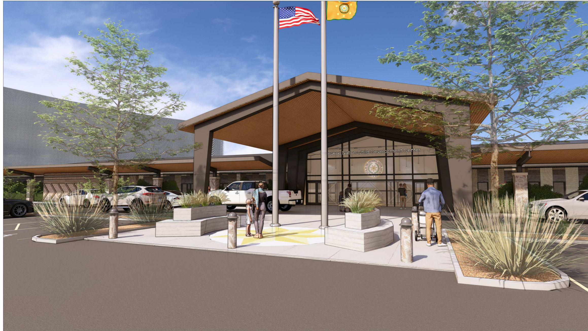
3-D REPRESENTATION FOR ILLUSTRATIVE PURPOSES ONLY. REFER TO DRAWINGS AND DETAILS

INTERIM REVIEW ONLY THESE DOCUMENTS ARE INCOMPLETE. THEY ARE NOT INTENDED TO BE USED FOR PERMIT, BIDDING, OR CONSTRUCTION. 3/13/2024 4:42:48 PM