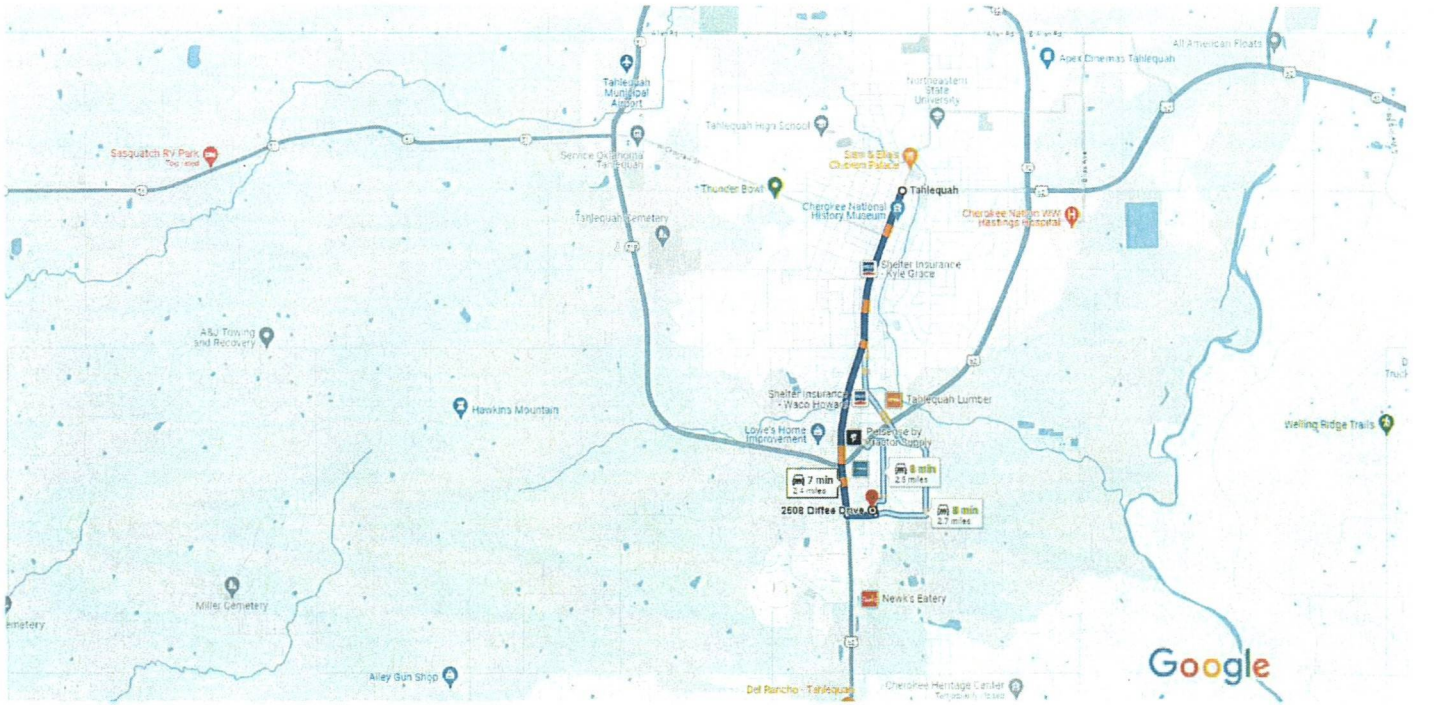
Map data ©2024 Google 2000 ft