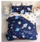
Twin boy bedding