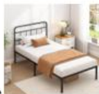
Twin bed frame