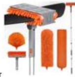
Extendable cleaner duster