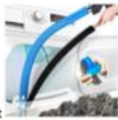
Dyer vent cleaner kit