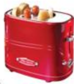
Hot dog machine