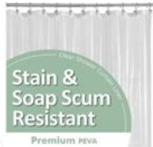
Shower curtain liner