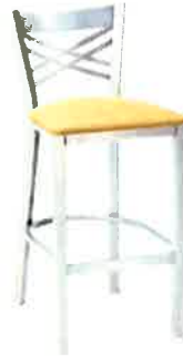
Photo for chair model only, finishes not shown.

Model Number: 577BS Model Name: Mama Melissa Barstool Material/Finish: Frame: Ultra Bronze; Seat: TX-05 Dimensions: Overall Width: 19.25" Overall Depth: 20.25" Overall Height: Arm Height: N/A Seat Depth: Seat Cushion Style: Upholstered COM Back Cushion Style: N/A Cushion content: N/A COM/COL: TX-05