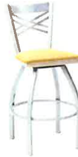
Photo for chair model only, finishes not shown.

Model Number: 6577BS Model Name: Mama Melissa Swivel Barstool Material/Finish: Frame: Ultra Bronze; Seat: TX-05 Dimensions: Overall Width: 19.25" Overall Depth: 20.25" Overall Height: Arm Height: N/A Seat Depth: Seat Cushion Style: Upholstered COM Back Cushion Style: N/A Cushion content: N/A COM/COL: TX-05