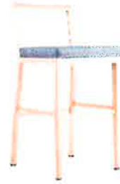
Photo for chair model only, finishes not shown.

Model Number: Woodlook 3.3 Model Name: Woodlook 3.3 Material/Finish: Frame: 24A Walnut; Seat: TX-03 Dimensions: Overall Width: 18.5" Overall Depth: 19.8" Overall Height: 42.5" Arm Height: N/A Seat Depth: Seat Cushion Style: Back Cushion Style: Cushion content: COM/COL: TX-03 COM Yardage: 0.44 yds