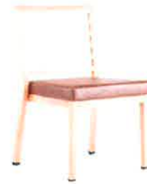
Photo for chair model only, finishes not shown.

Model Number: Woodlook 1.3 Model Name: Woodlook 1.3 Material/Finish: Frame: 24A Walnut; Seat: TX-02 Dimensions: Overall Width: 19.3" Overall Depth: 20.3" Overall Height: 33.7" Arm Height: N/A Seat Depth: Seat Cushion Style: Back Cushion Style: Cushion content: COM/COL: TX-02 COM Yardage: 0.44 yds