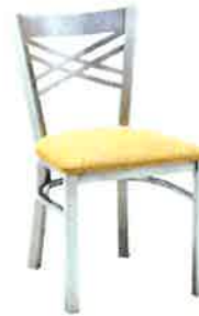
Photo for chair model only, finishes not shown.

Model Number: 577 Model Name: Mama Melissa Chair Material/Finish: Frame: Ultra Bronze; Seat: Natural Dimensions: Overall Width: 19" Overall Depth: 22" Overall Height: Arm Height: N/A Seat Depth: Seat Cushion Style: Wood Back Cushion Style: N/A Cushion content: N/A COM/COL: N/A