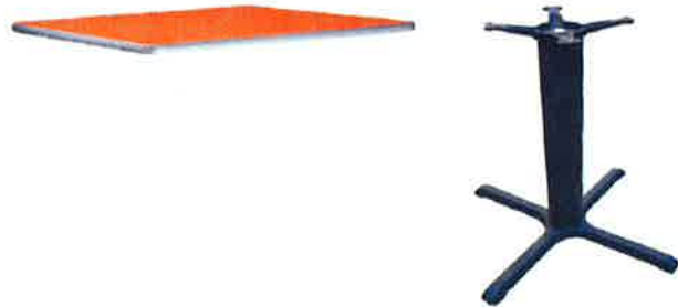
Photo for table model only, finish below.

Top Model: Rectangular P-Lam top with Rubber Edge Table Top Finish: Wilsonart Manitoba Maple 7911 Edge Color: Black Dimensions: 32" x 24" Base Model: CAST 450B Base Finish: Black textured Base Height: 28.3" Base Spread: 22" x 29.5" Column: 3" dia