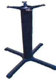
Photo for table model only, finish below.