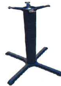
Photo for table model only, finish below.