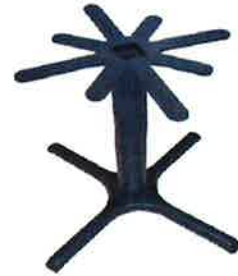
Photo for table model only, finish below.