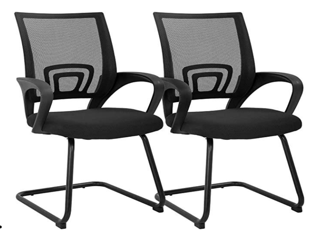
Office Guest Chair Reception Chairs with Lumbar Support Armrest Mesh Cushion Seat Conference Chairs Meeting: Set of 2

Product Specifications and Requirements Provided by: CN Grand Services Department