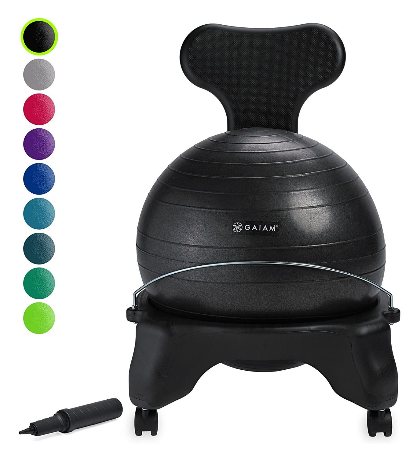
Gaiam Classic Balance Ball Chair – Exercise Stability Yoga Ball Premium Ergonomic Chair for Home and Office Desk with Air Pump, Exercise Guide and Satisfaction Guarantee