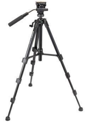
Magnus VT-200 Tripod System with 2-Way Pan Head OTY 2