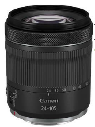
<u>Canon</u> <u>RF 24-105mm f/4-7.1 IS STM Lens</u> <u>QTY 3</u>