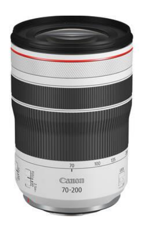
<u>Canon</u> <u>RF 70-200mm f/4 L IS USM Lens</u> <u>QTY 2</u>