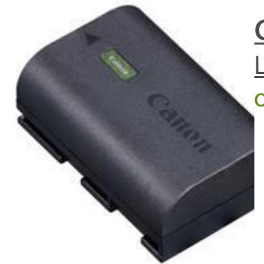
<u>Canon</u> <u>LP-E6NH Lithium-Ion Battery (7.2V, 2130mAh)</u> OTY 3