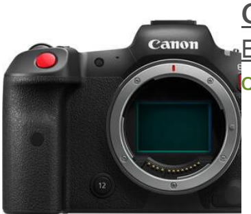
Canon EOS R5 C Mirrorless Cinema Camera