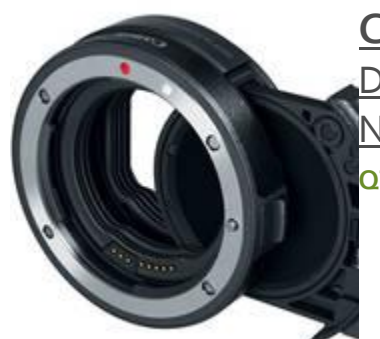
Canon Drop-In Filter Mount Adapter EF-EOS R with Va ND Filter OTY 1