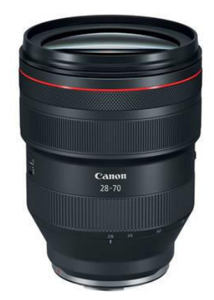
<u>Canon</u> RF 28-70mm f/2 L USM Lens QTY 1