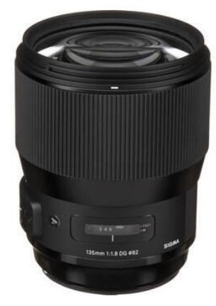
<u>Sigma</u> 135mm f/1.8 DG HSM Art Lens for Canon EF QTY 1