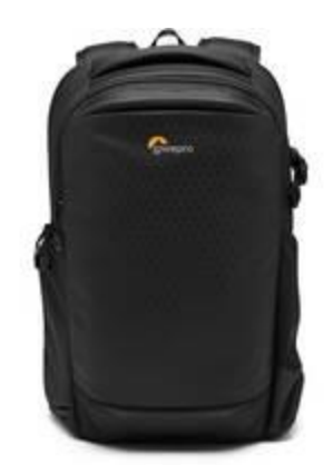
Lowepro Flipside 300 AW III Camera Backpack (Black) OTY 5