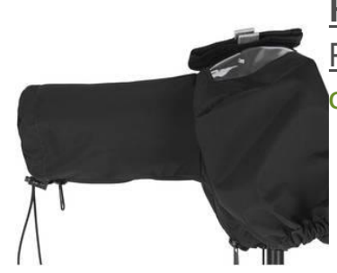
PortaBrace Rain Cover for Canon EOS R Camera OTY 2