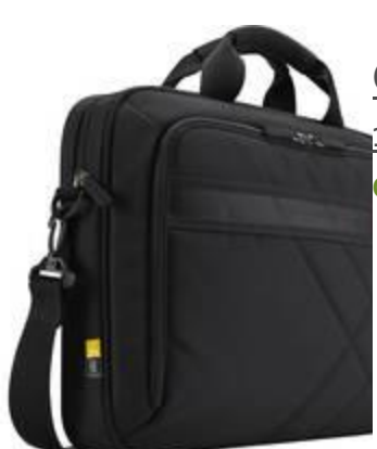
Case Logic 15.6" Laptop and Tablet Case (Black/Red Accent OTY 5