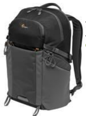
<u>Lowepro</u> Photo Active BP 300 AW Backpack (Black/Dark (OTY 1

<u>Tie Clip for Pearstone OLM2, Senal OLM2, Senn</u> <u>ME2, and Sony ...</u>