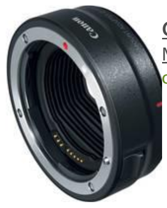
Canon Mount Adapter EF-EOS R OTY 5