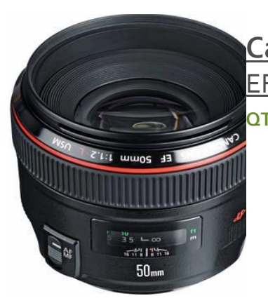
Canon EF 50mm f/1.2L USM Lens QTY 1