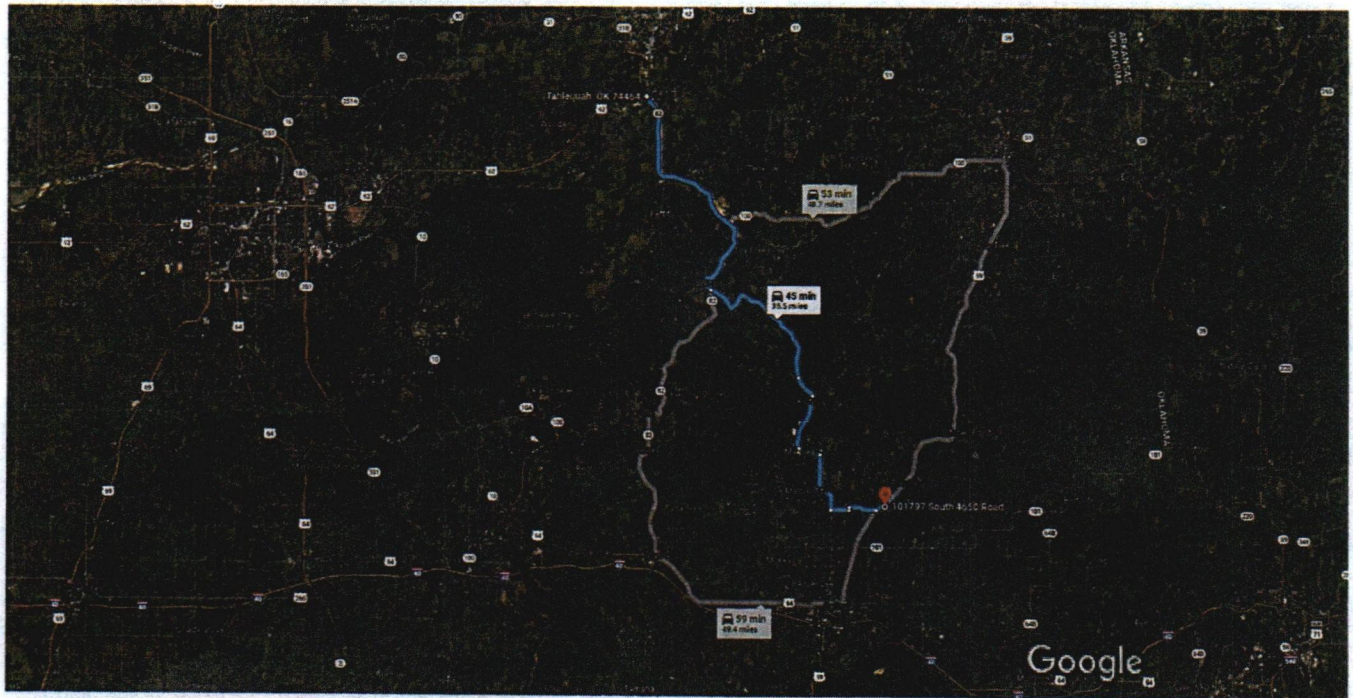
Imagery ©2023 TerraMetrics, Map data ©2023 Google 2 mi